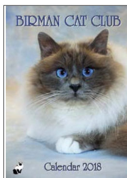
Club Calendar 2018