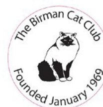
Car window sticker