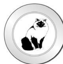
Car tax disc holder